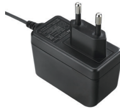
▲ UMVUR3018 P