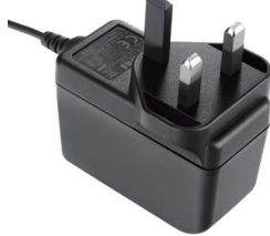
▲ UMVUK3018 P