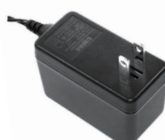
▲ UMVUL3018 P