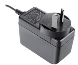
▲ UMVUG3018 P