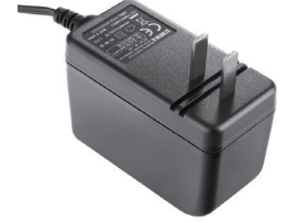
▲ UMVUZ3018 P