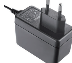
▲ UMVUE3018 P